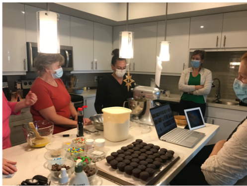
Mill Crossing Church 2021